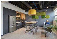
Stark County Commissioners IT Department Renovations