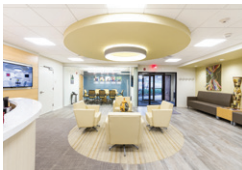
Akron Community Foundation Interior Office Rebuild