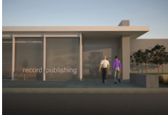
Dix Communications New Office Addition + Renovations