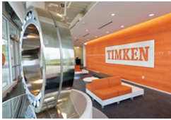
The Timken Company North Canton Campus Addition + Renovation