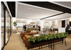
Stark County Commissioners Prosecutor's Office Renovations