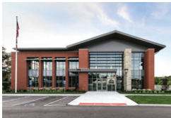
Campbell Oil Company New Headquarters