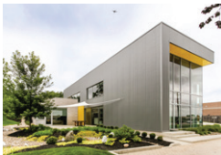
SoL Harris/Day Architecture New Corporate Office