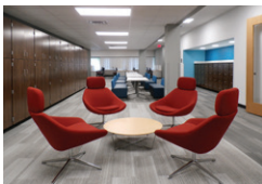
Stark County Educational Services Center Stark State College Offices Renovations