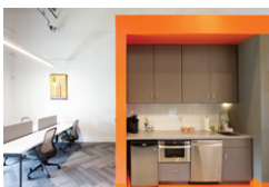
Cutler Realty New Albany Office Renovation