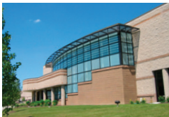
ASC Industries Office + Plant Addition + Renovation