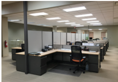
Siffrin, Inc. Interior Office Renovation