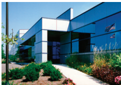
Diebold, Inc. New Headquarters Renovations