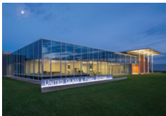
United Glass & Panel Systems New Headquarters