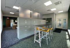
Stark County Commissioners Coroner's Office Renovations