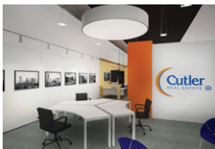
Cutler Realty Branding Study