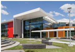
Bridgestone Americas New Akron Technical Center