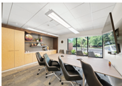
Akron Community Foundation Addition + Renovation