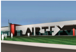
Airtex Products New Corporate Headquarters