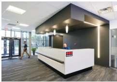
Securitas Electronic Security Interior Renovations - Phase 1 + 2