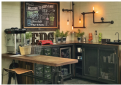
Environmental Design Group New Office Cafe