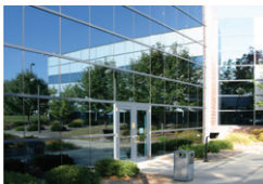
Diebold, Inc. Green Office Addition + Renovation