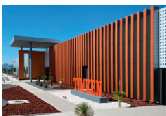
The Timken Company Mexico - New Plant + Offices